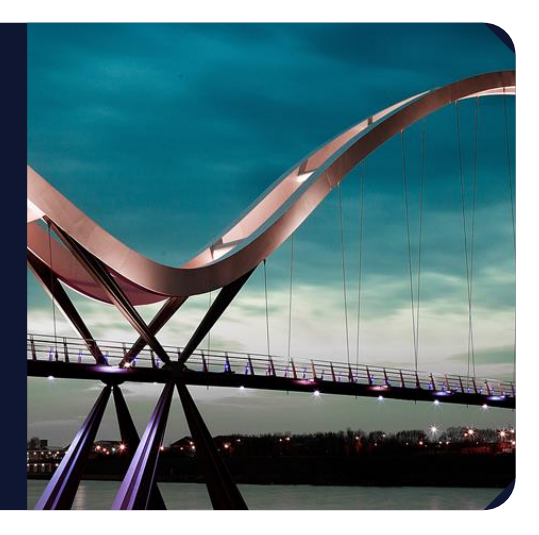
April 11, 2025